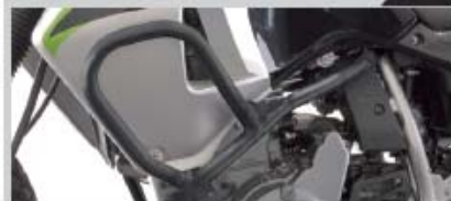
Engine Guard KLR650 E