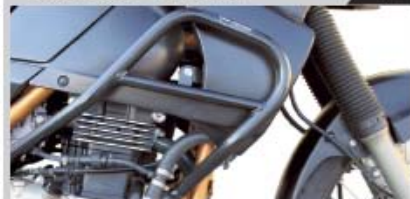
Crashbar KLR650 E