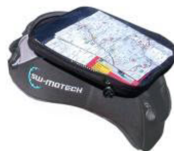
Optional map holder