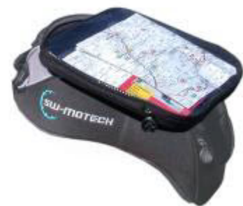
Optional map holder