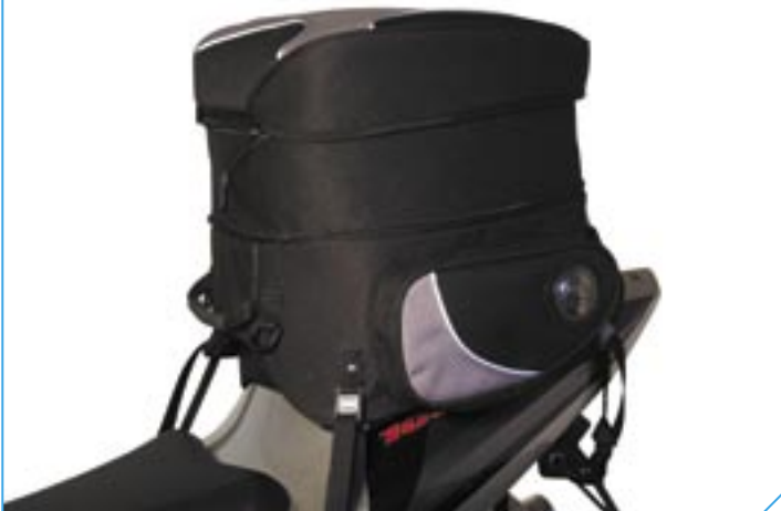
Rearbag tested on racetrack